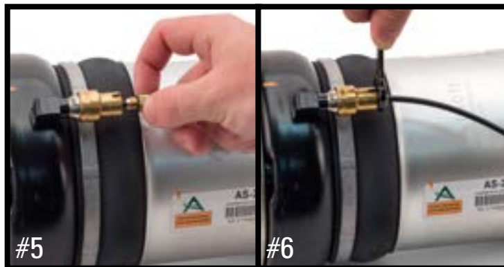
#5 INSERT FITTING AND AIRLINE INTO AIR SPRING