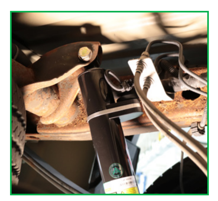
FIGURE 10 FIGURE 11

4. Connect the shocks wire harness to the vehicle. (Figure 12)