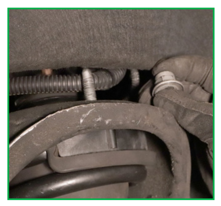
FIGURE 4 FIGURE 5