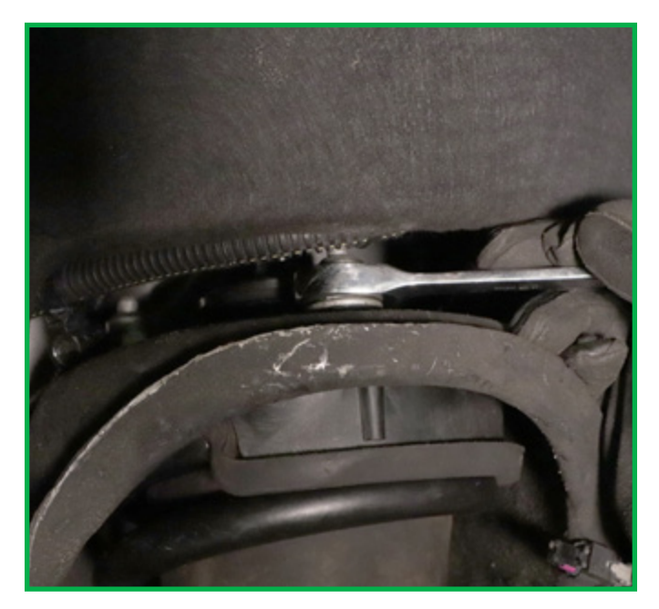
FIGURE 11 FIGURE 12

4. Reroute and connect the electrical connection. (FIGURES 13, 14)