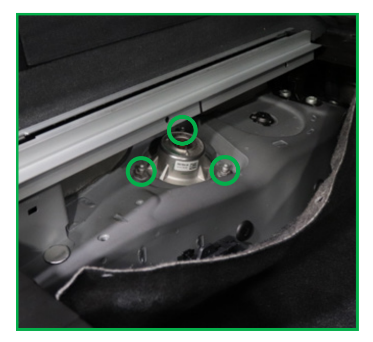
FIGURE 7 FIGURE 8