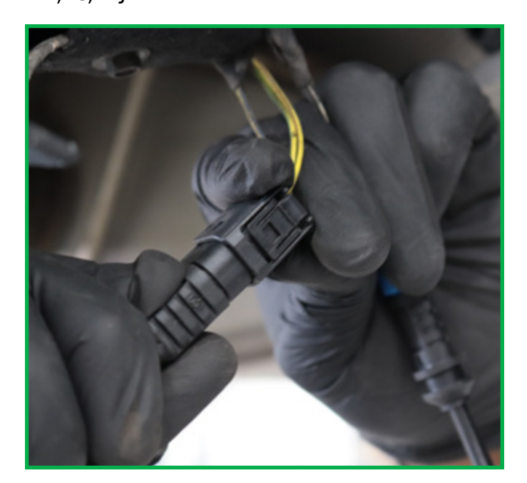
FIGURE 15 FIGURE 16