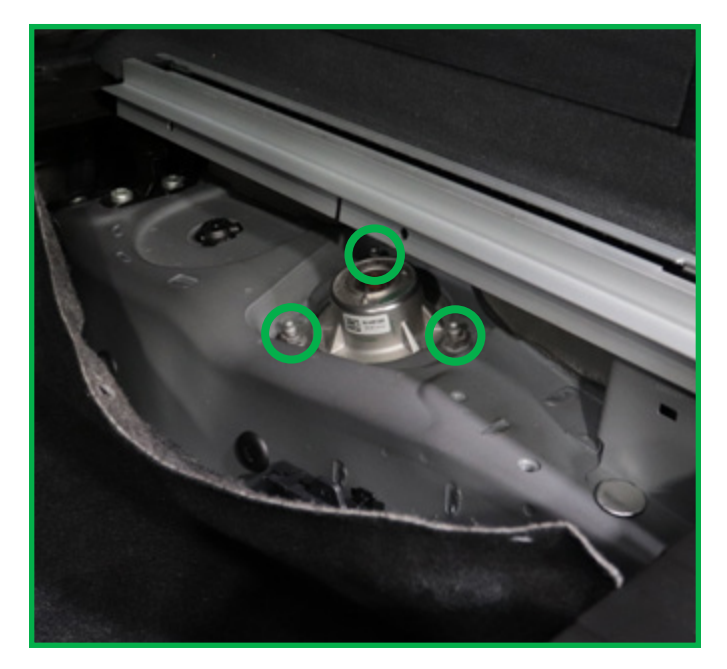
FIGURE 7 FIGURE 8