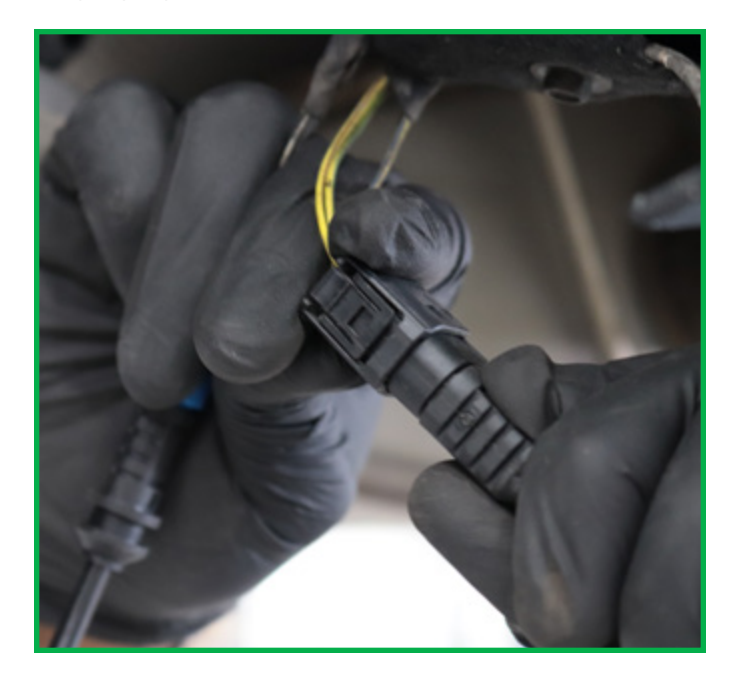
FIGURE 15 FIGURE 16