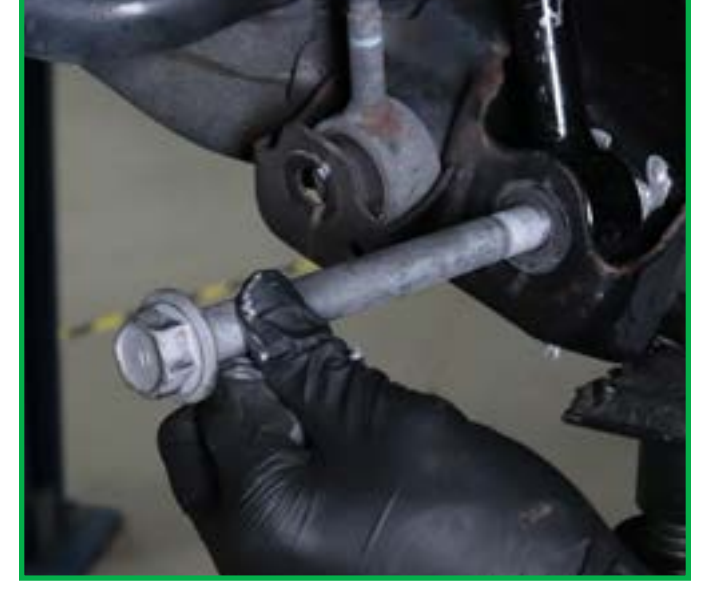
FIGURE 8 FIGURE 9