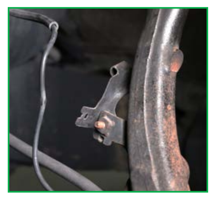
FIGURE 6 FIGURE 7

7. Remove the lower strut bolt and disconnect the sway bar link from the lower control arm. (Figures 8, 9)