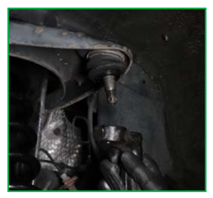
FIGURE 10 FIGURE 11

9. Remove the three strut top nuts. (Figure 12)