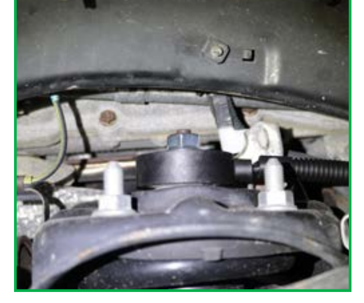
FIGURE 20 FIGURE 21

10 SK-3794 Installation Manual REV 01 November 1, 2023