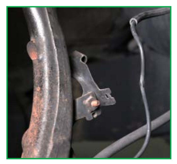
FIGURE 6 FIGURE 7

7. Remove the lower strut bolt and disconnect the sway bar link from the lower control arm. (Figures 8, 9)