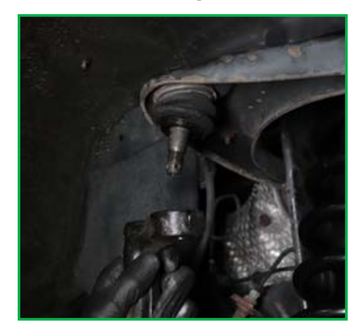
FIGURE 10 FIGURE 11

9. Remove the three strut top nuts. (Figure 12)