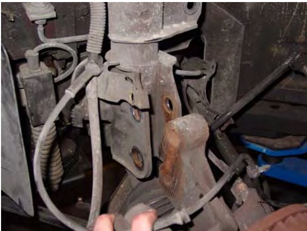
11. Knuckle will fall away from strut. ↑