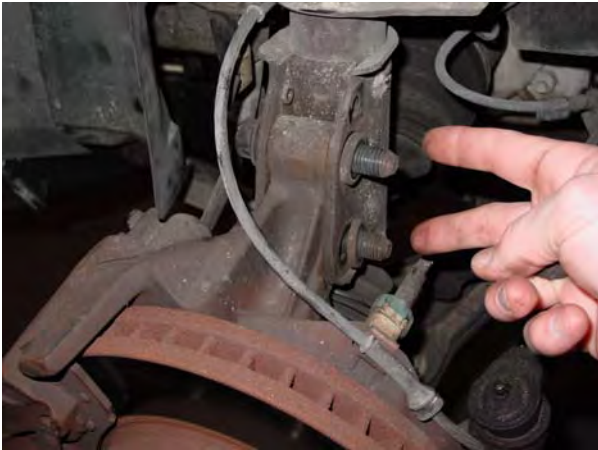
9. Remove the two nuts at the bottom of the strut. ↑