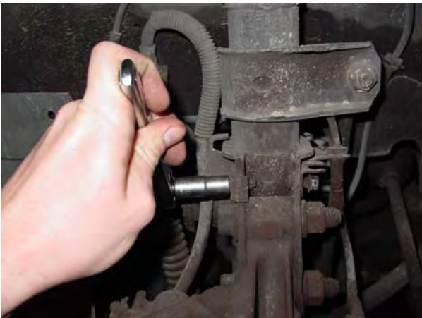
3. Unbolt the 2 side brackets from the strut. ↑ (These brackets hold the brake lines and other cables)