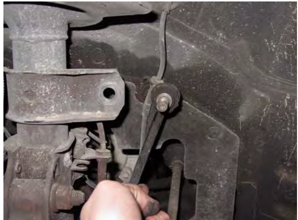
6. Remove stabilizer link from strut. ↑