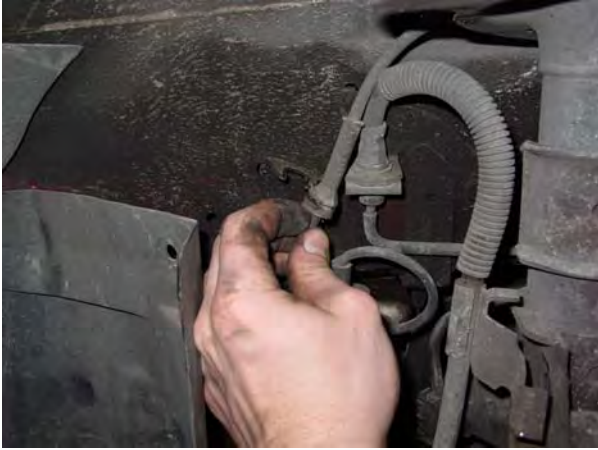
7. Remove strut damper solenoid cable from mounting brackets. ↑