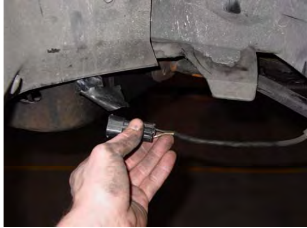
8. Unplug the strut damper solenoid. ↑