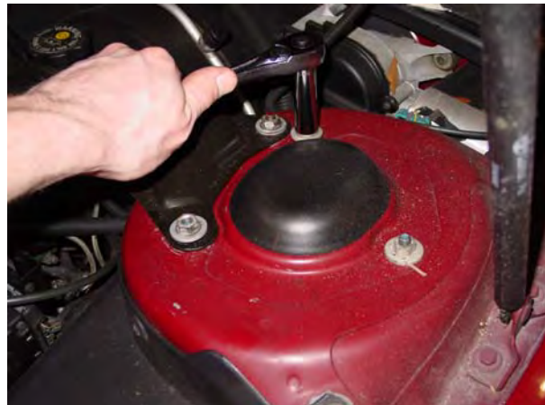
13. Remove 3 nuts attaching top of strut assembly to body. ↑