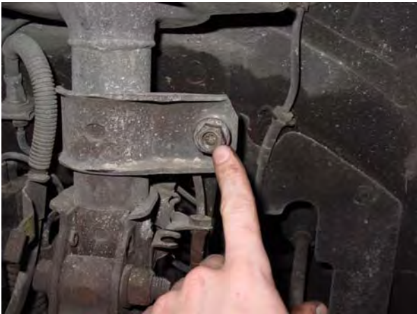
5. Remove nut from stabilizer link ↑