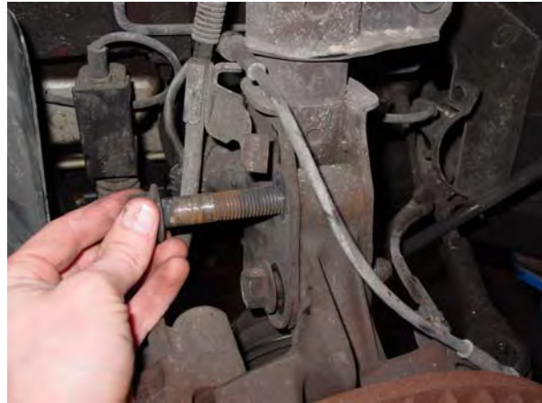
10. Remove the two strut-to-knuckle bolts. ↑