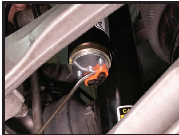
FIGURES 9, 10, 11