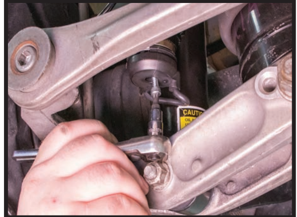
FIGURES 7, 8