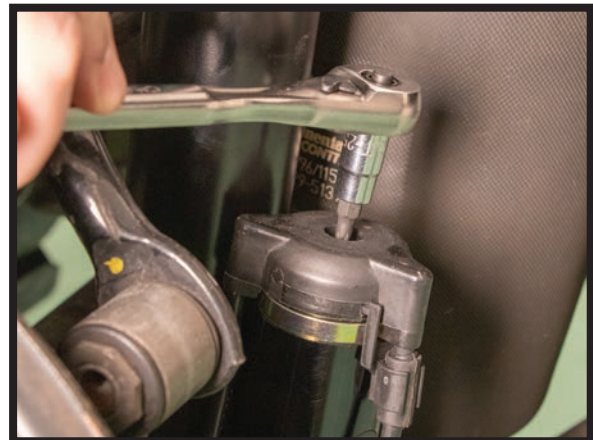
FIGURES 5, 6