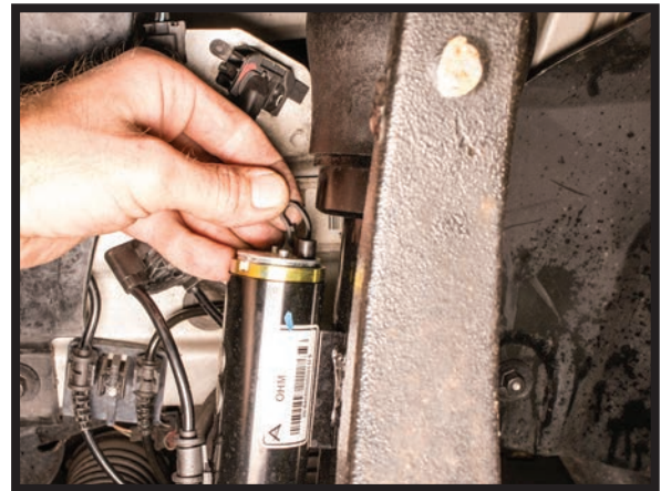
FIGURES 7, 8