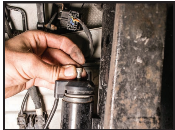
FIGURES 4, 5