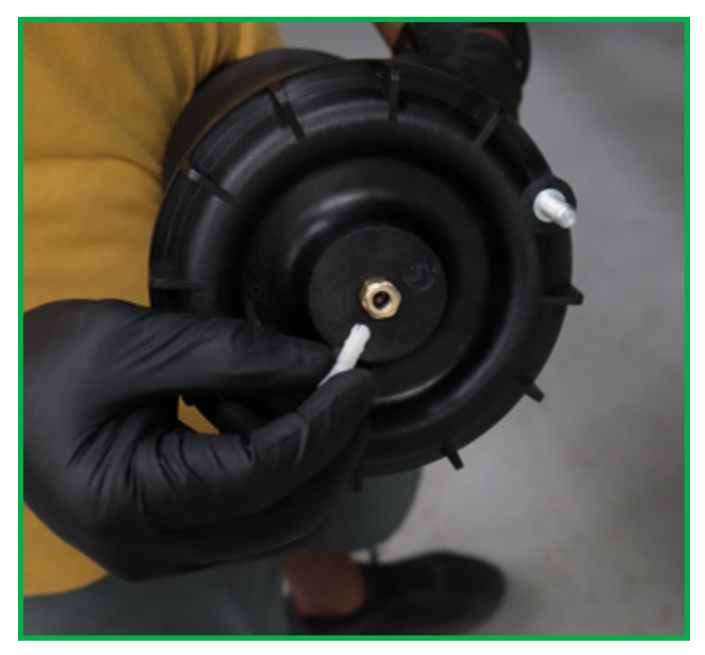
FIGURE 6 FIGURE 7